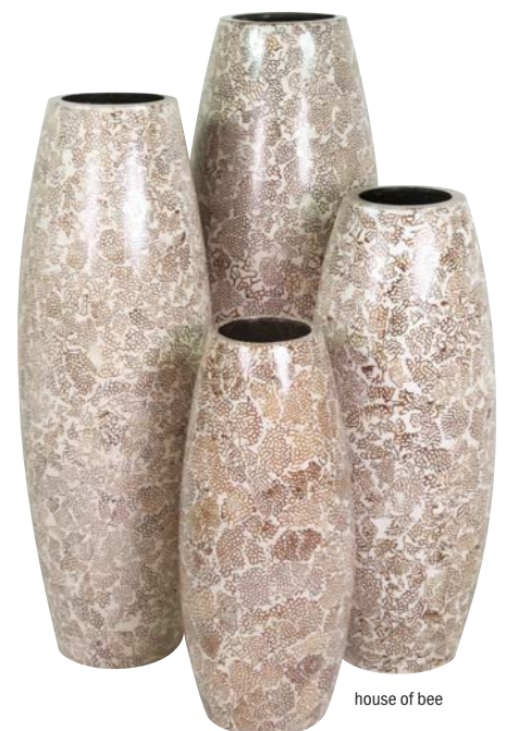
house of bee